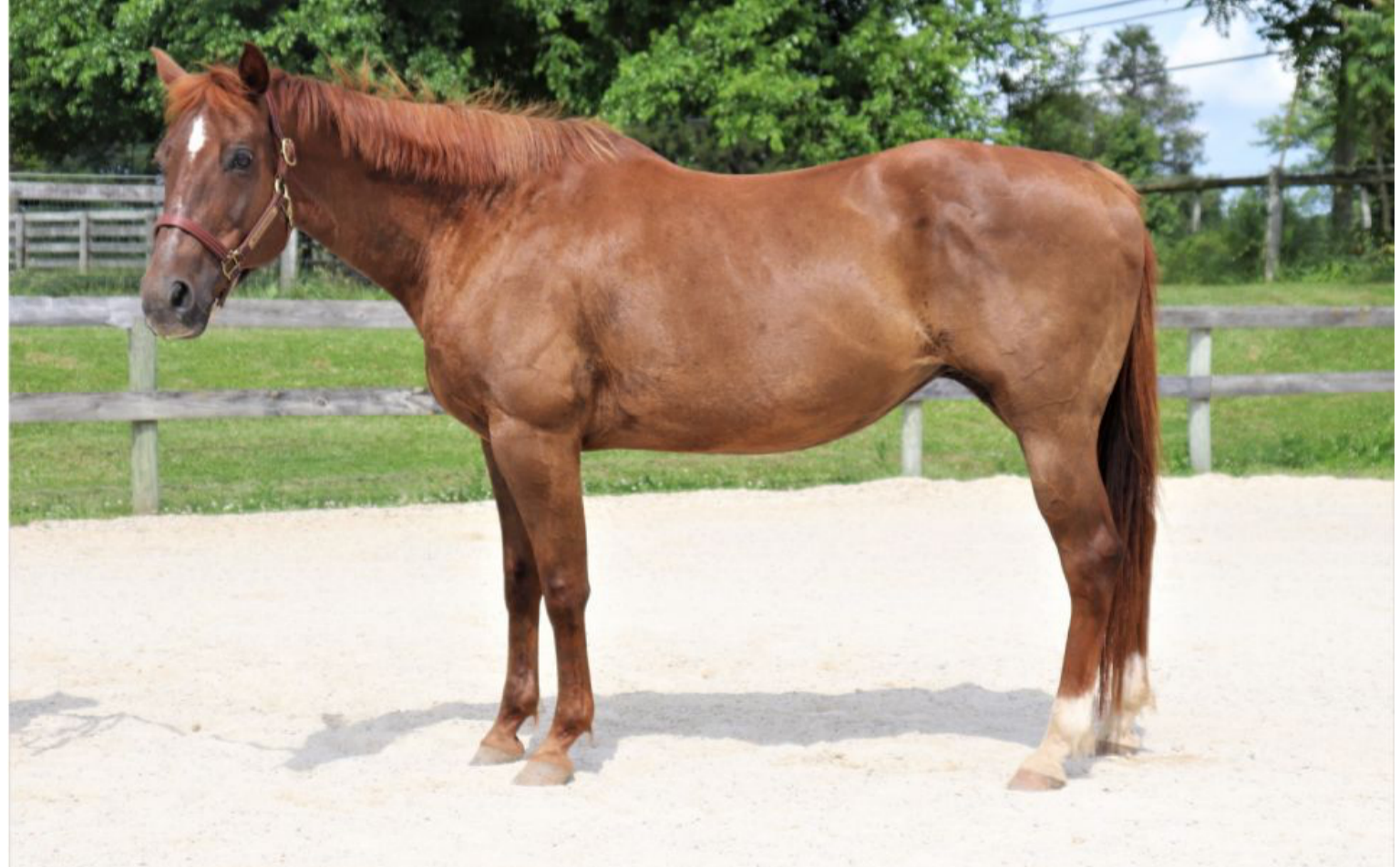
Seventeen-year-old Quarter Horse mare, 14.2hh

Twisted Tinsel is a 14.2 chestnut mare that is looking for her happily ever after. Although no longer a able to pasture for sound and currently living outside 24/7. She is patient with her handlers and would enjoy an active and social retirement. Great with people and horses, she is fond of scratches and will rest her nose on your belly so you can pay special attention to her ears and forehead and under her chin.